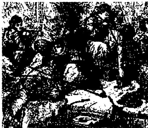
THE DRAWING FROM AN 1874 EDITION OF THE ILLUSTRATED PUNCH NEWS PAPER IS THE INTERIOR OF A MARIJUANA OCA FOR WOMEN ON THE ALIEN IN NEW YORK CITY.