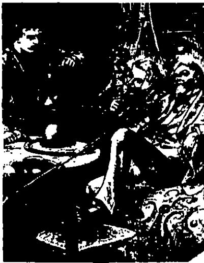
At the 1976 Government Exhibition in Chicago, a large hemp plant was offered as the "miraculous" health, distributed among the 100,000 people in the U.S. since 1917, was by George Washington, Vol 33 1796, Government Printing Office